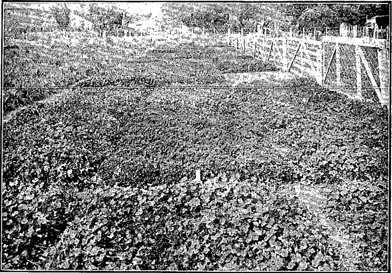
FIG. 6. SUBTERRANEAN-CLOVER STRAIN TRIALS.

Group 2 contains strains which have grown particularly well at all periods. This is shown in the following Tables 3 and 4, which give actual green weights, also in Tables 1 and 2, which have been computed from figures allotted by an eye-estimation method.