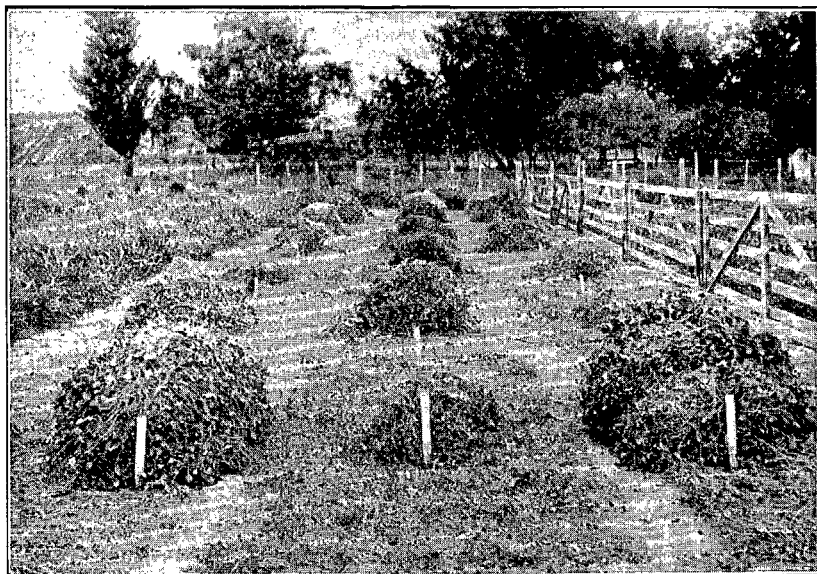
FIG. 5. SUBTERRANEAN-CLOVER TRIALS SHOWING THE TOTAL AMOUNT OF HERBAGE PRODUCED FROM THE LATE WINTER TILL THE END OF SPRING ON THE SAME PLOTS AS SHOWN IN FIG. 4.

Group 1.—Each strain included in this group has small dark-green-coloured, indistinctly marked leaves. The plants were stemmy and prostrate in habit. In the year of planting the time of commencing growth was delayed till the beginning of August, and even then the growth consisted of only a few short trailing stems bearing a number of florets but very few leaves. Flowering commenced very early (the first week in August). Subsequent growth was limited in amount,