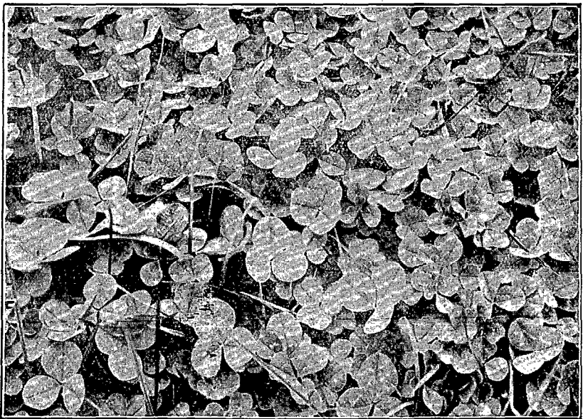
FIG. 2. PERENNIAL RYE-GRASS, WHITE CLOVER, SUBTERRANEAN CLOVER IN ASSOCIATION ON RIVER-ACCRETION COUNTRY.

White clover is dominating the subterranean clover wherever the soil fertility is sufficiently high for good white-clover growth or is being maintained at a high level by the use of superphosphate.