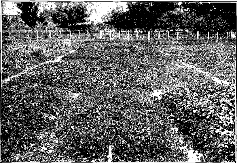
FIG. 4. SUBTERRANEAN CLOVER TRIALS SHOWING THE TOTAL AMOUNT OF GROWTH UP TILL THE END OF SPRING.

Altogether fifty-seven different samples of this seed have been grown at this station. Nine were from commercial sources and forty-eight were obtained from Australian research stations. After making general