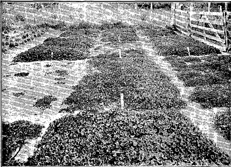
FIG. 7. SUBTERRANEAN-CLOVER STRAIN TRIALS.

Autumn re-establishment showing delayed germination and growth of the late-flowering strains. Date : 16th March, 1936.