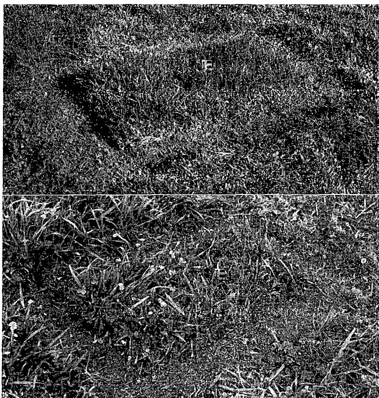
FIG. 2: Top — Poa -dominant pasture in winter (2350 kg DM/ha). Bottom — Paspalum -dominant pasture in summer (2800 kg DM/ha).

species, paspalum in summer Passes through its vegetative stages very rapidly, so that if grazed leniently it oan assume a pervading dominance yielding much TDM, but relatively little ADM for milking cows (Fig. 2) .