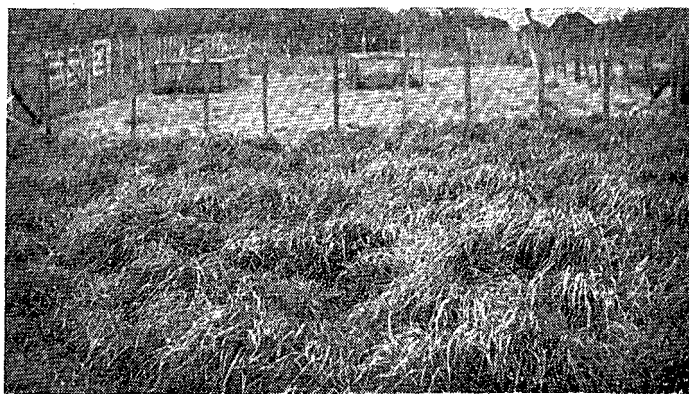
General view of trial. Left: Welsh S.26 pasture-hay strain. Right: Grasslands strain.

Each cocksfoot strain was sown at 25lb. per acre with '31b. per acre of Certified pedigree white clover and 5lb. per acre of a poor type of Italian ryegrass.