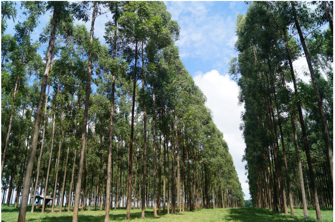
Figure 2 Integrated livestock-forest system in March 2019, with trees' spacing of 15 m x 4 m (167 stems ha -1 ).

hectare. One RSU is defined as an animal with an intake of 6000 MJ ME year -1 or 550 kg DM year -1 . As an example, ewes are roughly 1 RSU each, while steers 5.5 RSU each. The stocking rate in CONT represents a typical condition for Brazilian grasslands, as the national average rate is 5.06 RSU ha -1 (Brazilian Institute of Geography and Statistics 2019). The rotational grazing system (ROT) was established in 2007, based on a monoculture of palisade grass ( Urochloa brizantha 'Piatã'). The system is divided into six paddocks, and the grazing management was kept as six days of grazing and 30 days of rest throughout the year. The stocking rate ranged from 8.3 to 16.5 RSU ha -1 , or 1.5 to 3.0 AU ha -1 , depending on forage availability in each season.