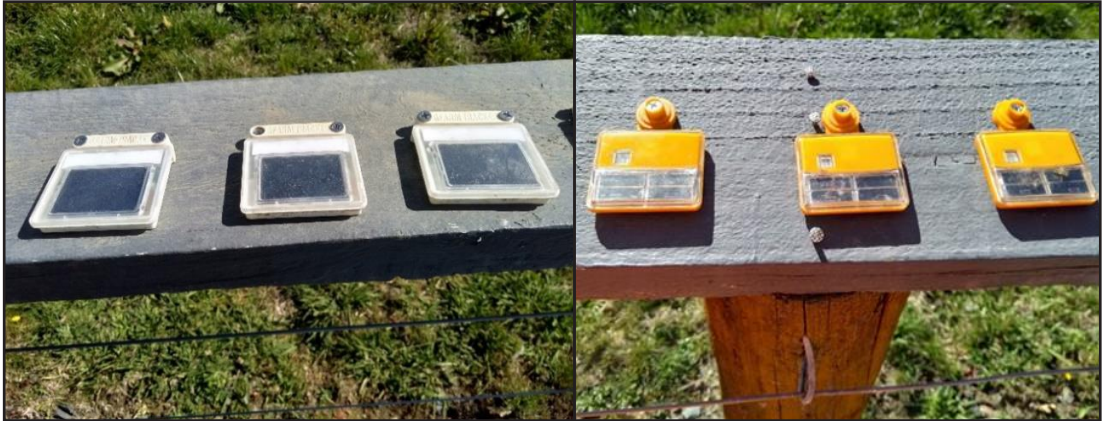
Figure 1 GPS devices during static testing. Agtech tags are shown on the left and mOOvement on the right.